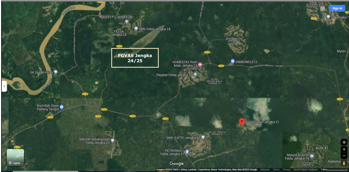
Map 1: Location of Mill and Estate