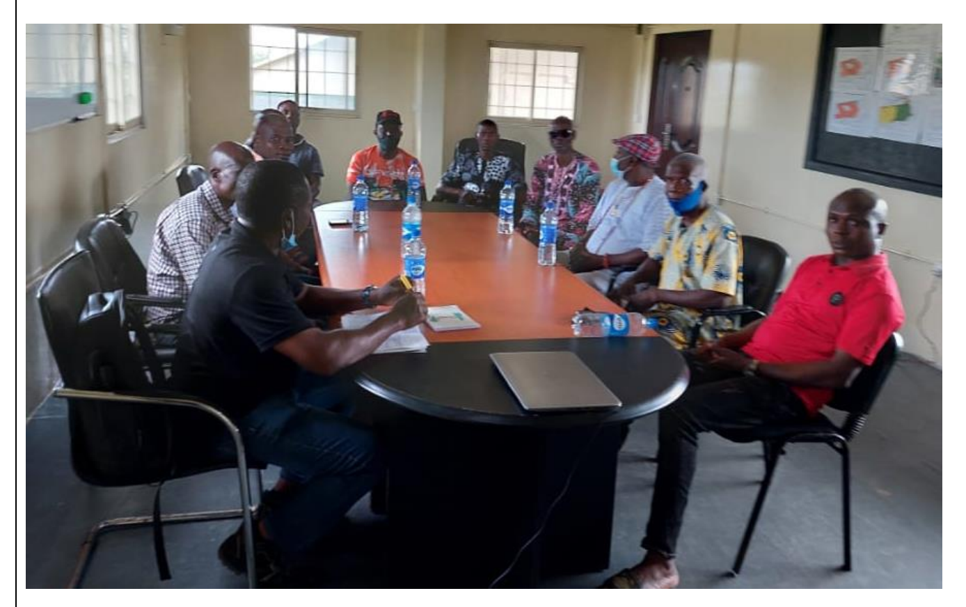
Figure 8: Meeting with indirectly affected communities