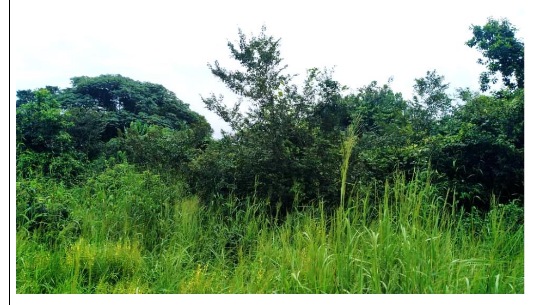
Figure 6: On-site verification of the Ikukusu bush (HCV 5 and 6)

e) High Carbon Stock Assessment (HCSA) Assessment