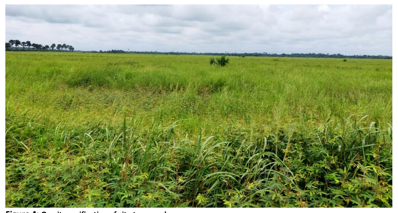
Figure 4: On-site verification of site topography

During site visit, it was confirmed from visual inspection that there are no marginal soil, river riparian buffer zones, steep terrain or peat soil present in the proposed new planting area, while the presence of the pond and swamp areas were confirmed and cover only a small area of the site.