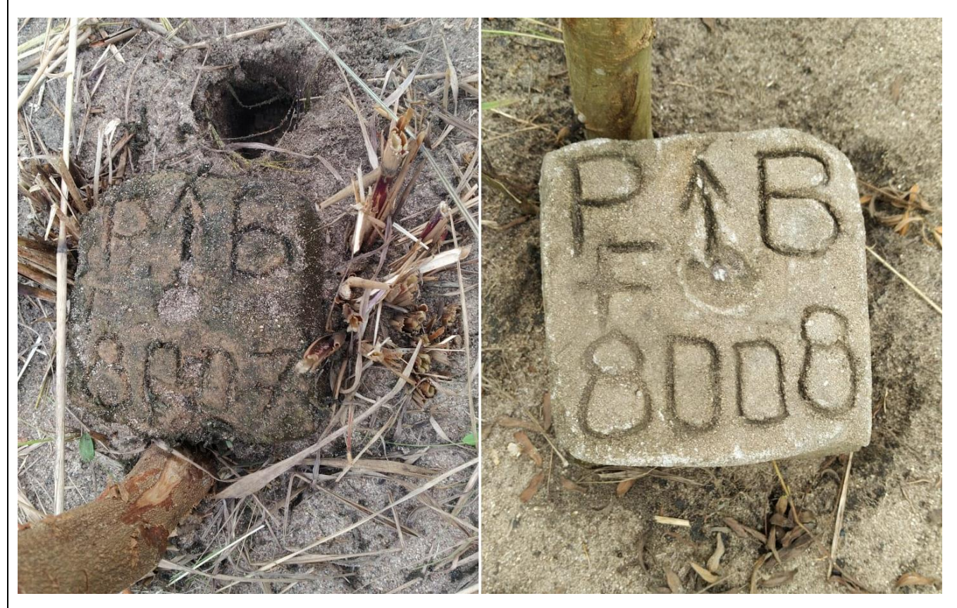
Figure 3: Sampled boundary stones at proposed new planting site for Sakponba Extension 1