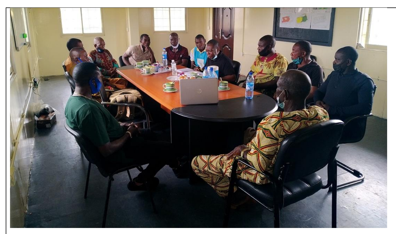
Figure 7: Meeting with directly affected communities