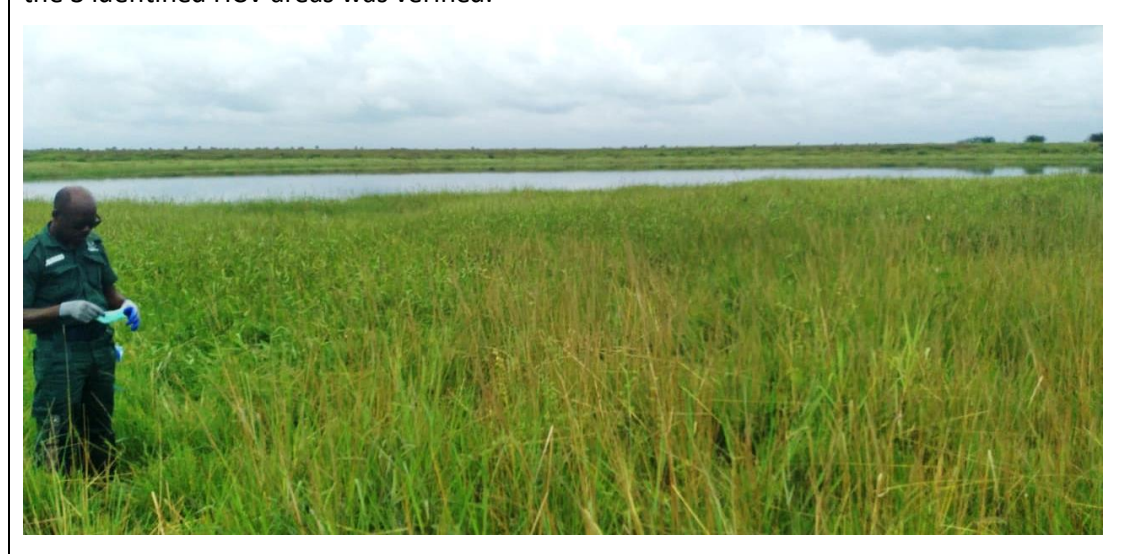
Figure 5: On-site verification of the Izabumwen pond (HCV 3 and 6)

Records of signed attendance lists of local community members in HCV consultation were sighted by the verification team. During the on-site verification on 22 – 23 September 2021, it confirmed from meetings with surrounding local community representatives that the company engaged consultants to engage with them to identify relevant HCV areas, and there are no areas important to them that were not identified. The conditions of the proposed new planting area was confirmed to match the findings of the HCV assessment and the presence of the 3 identified HCV areas was verified.