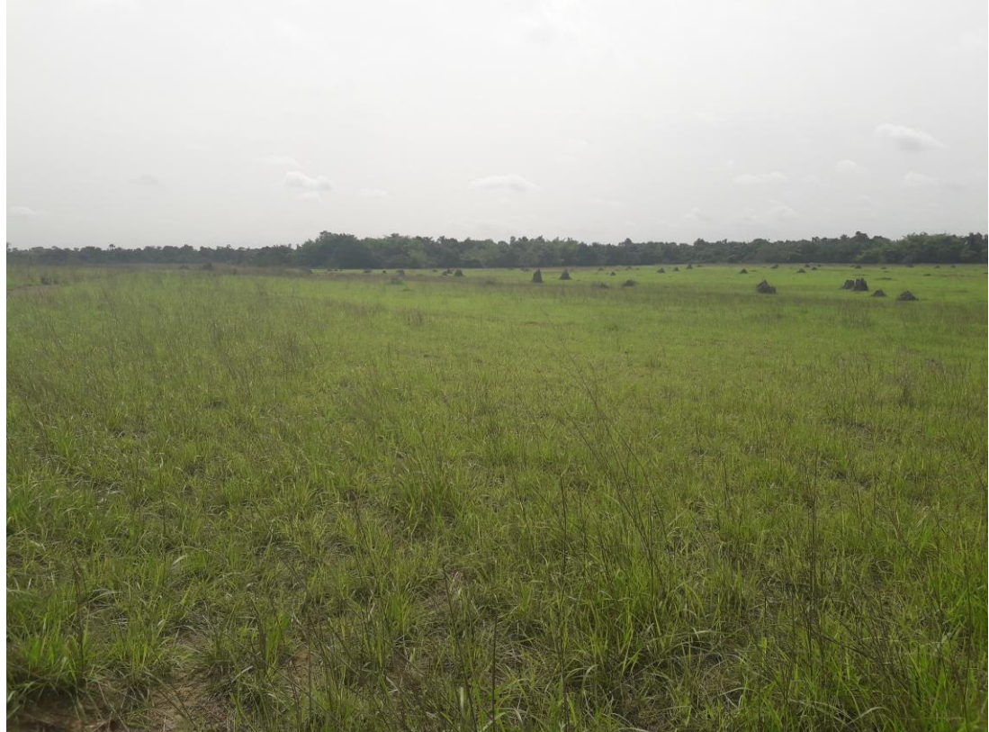
Figure 5. Photogrpah verification to ensure there is no activity in Sakponba NPP proposed area on August 22, 2017