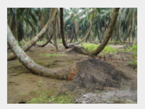
Figure 1: Leaning palms mainly caused by peat subsidence

A practical approach to rehabilitate leaning and fallen palms is to carry out soil mounding to minimise root desiccation and promote new root development (see Figure 1). The soil for mounding the exposed roots of leaning palms should be taken from outside the palm circles in order to prevent damage to the surface feeder roots (Lim and Herry, 2010).