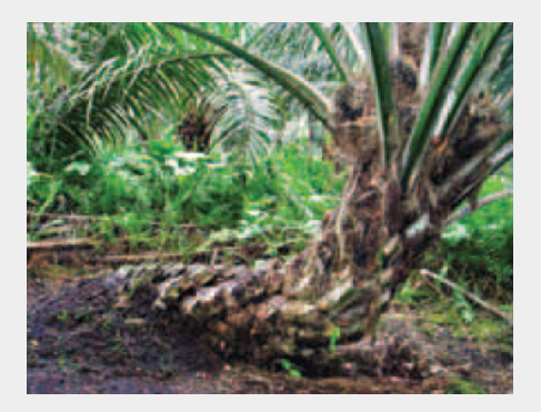
Figure 2: Rehabilitated leaning palm after two years of soil mounding carried out on exposed roots

A practical approach to rehabilitate leaning and fallen palms is to carry out soil mounding to minimise root desiccation and promote new root development (see Figure 1). The soil for mounding the exposed roots of leaning palms should be taken from outside the palm circles in order to prevent damage to the surface feeder roots (Lim and Herry, 2010).