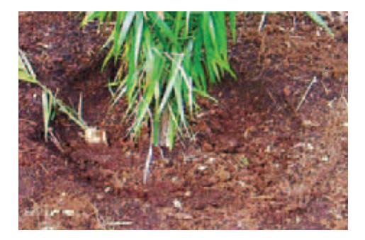
Figure 3: Hole-in-hole planting on compacted peat surface.