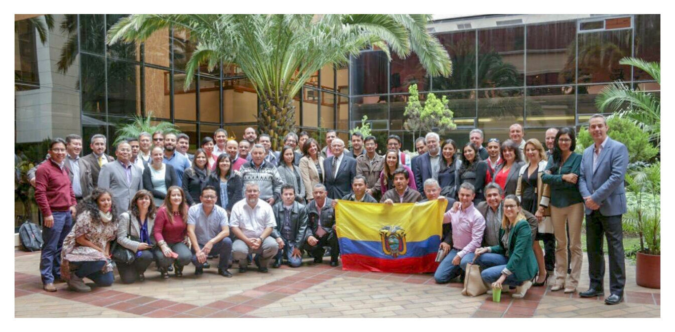
In March 2017, the Ecuadorian national government and RSPO signed a memorandum of understanding (MoU) committing to the process of RSPO Jurisdictional Certification, placing them as pioneers in Latin America.

the first in Latin America. This decision has the potential to inspire other countries to follow, and adopt and implement RSPO's P&C at the national level, ensuring the inclusion of all stakeholders in the production chain from smallholders to large producers to achieve the goal of sustainable palm oil production.